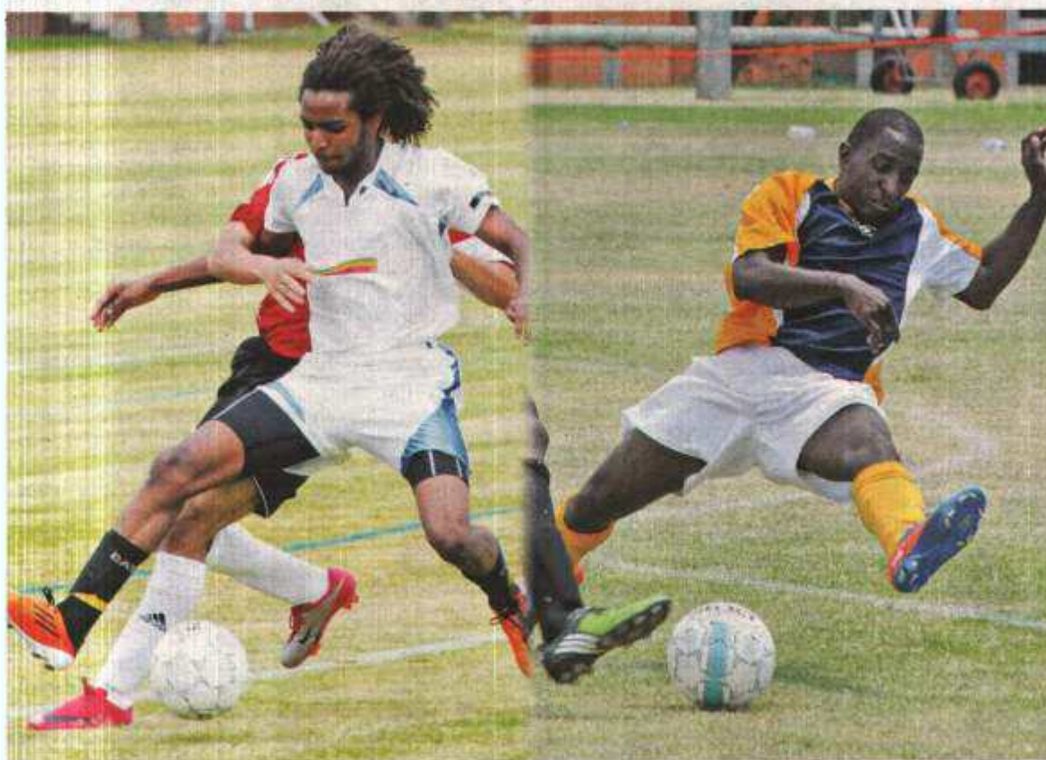
[L] Kenya [4-0] in action against Egypt. [R] The Zambian team lost to Kenya 7-0.

FORRESTFIELD United Soccer Club is hosting the 2012 Perth African Nations Cup at Hartfield Park.