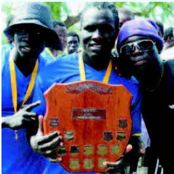
Members from last year's winning team, Sudan, with the shield.